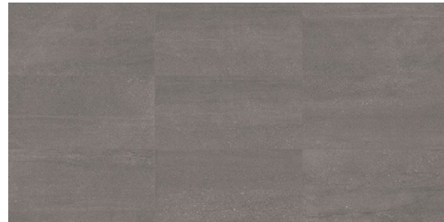
Grey - Rect. 12"x24" 8mm Matte