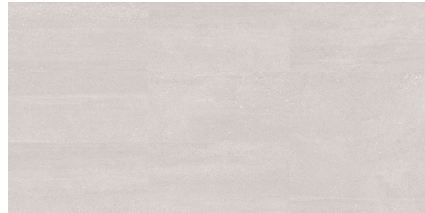
Ivory - Rect. 12"x24" 8mm Matte