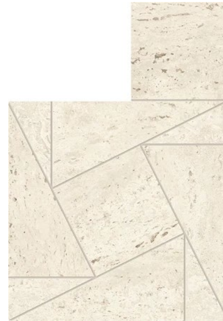
White 9"x10" Matte