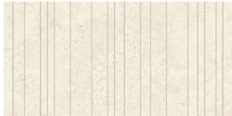
White 12"x24" Matte