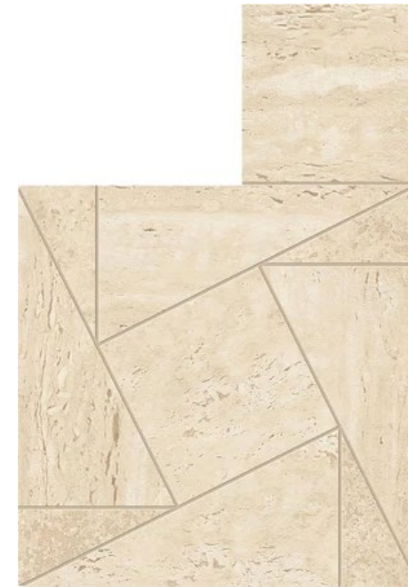
Sand 9"x10" Matte