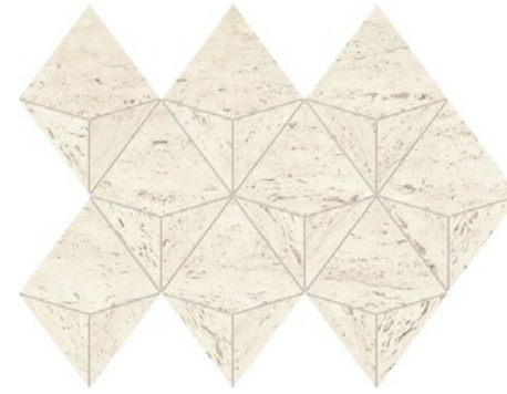
White 11"x16" Matte