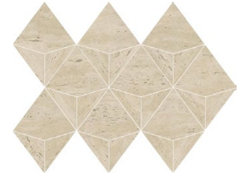
Pearl 11"x16" Matte