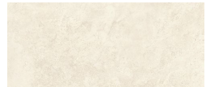
White Cross - Rect. 48"x48" 9mm Matte 24"x48" 9mm Matte/Grip 24"x24" 9mm Matte