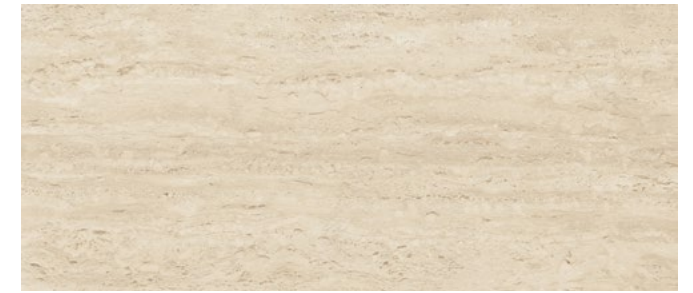
Sand Vein - Rect. 48"x110" 6mm Matte 48"x95" 9mm Matte 24"x48" 9mm Matte/Grip 24"x48" 20mm Outdoor