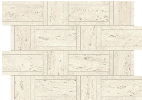
White 14"x18.5" Matte