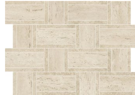
Pearl 14"x18.5" Matte