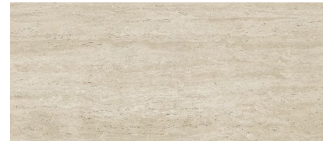
Pearl Vein - Rect. 48"x110" 6mm Matte 48"x95" 9mm Matte 24"x48" 9mm Matte/Grip 24"x48" 20mm Outdoor