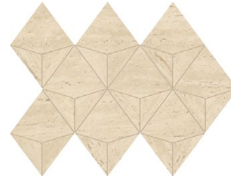
Sand 11"x16" Matte