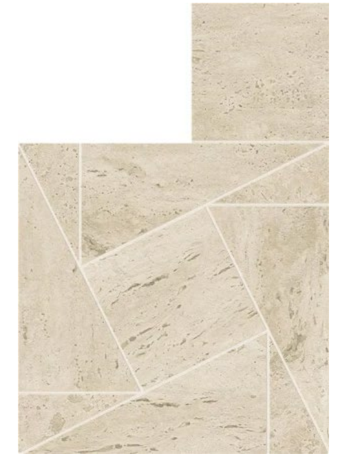
Pearl 9"x10" Matte