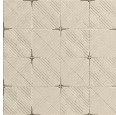
Pearl Diamond 24"x24" Matte