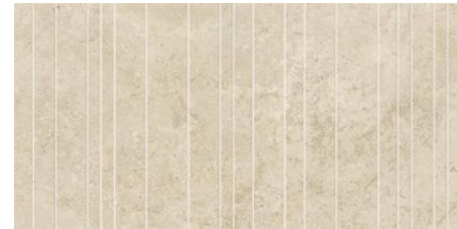
Pearl 12"x24" Matte