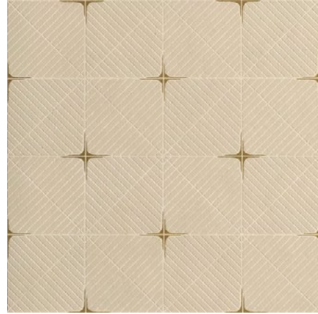
Sand Diamond 24"x24" Matte