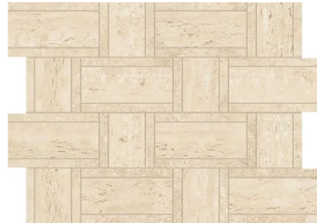
Sand 14"x18.5" Matte