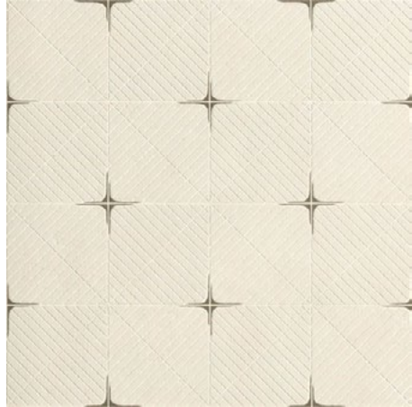
White Diamond 24"x24" Matte