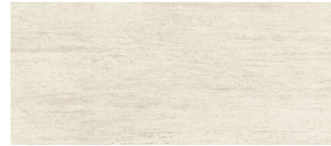
White Vein - Rect. 48"x110" 6mm Matte 48"x95" 9mm Matte 24"x48" 9mm Matte/Grip 24"x48" 20mm Outdoor