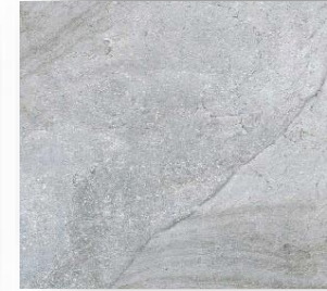
Light Gray AE02