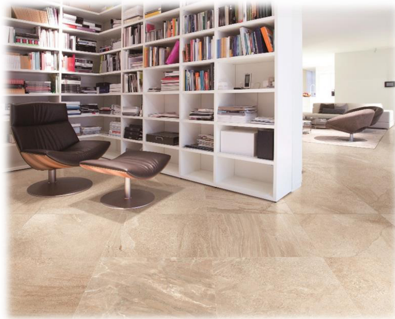
Light Brown AE03 shown in a grid pattern.

A striking emulation of authentic stone, the Santorini series captures the dramatic natural beauty of the Greek Islands. The bold stone visual is balanced with a versatile, traditional color palette that lends itself to modern design. Available in 18" x 36", 24" x 24", 12" x 24" and a 2" x 4" mosaic, this series also includes a 6" x 12" Cove Base, 4" x 12" Bullnose, 1" x 6" Cove Base Corner and two finishes: Matte and Polished.