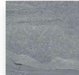
Dark Gray AE04