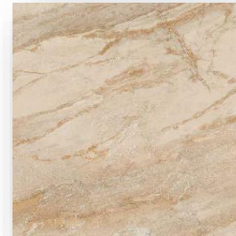
Light Brown AE03