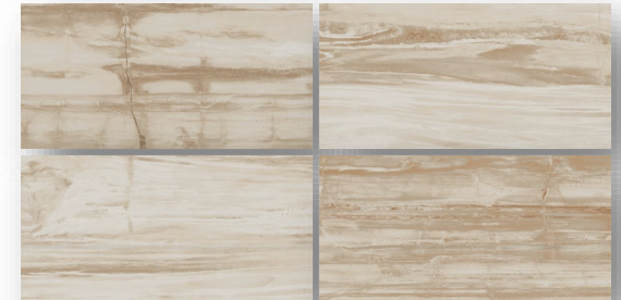
Petrified Honey NW02