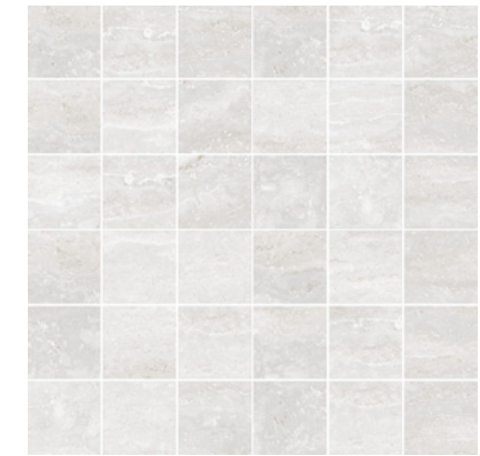
White 2x2 Mosaic 12"x12" 8.2mm Matte