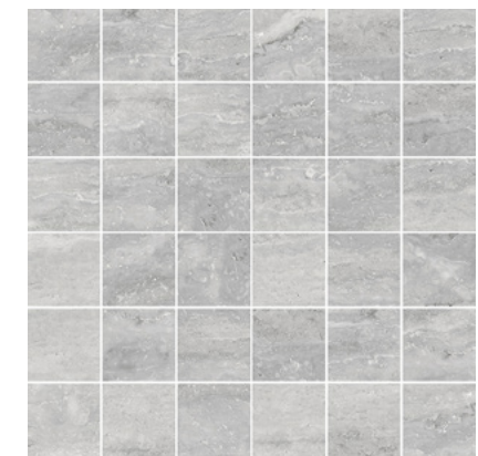
Light Gray 2x2 Mosaic 12"x12" 8.2mm Matte