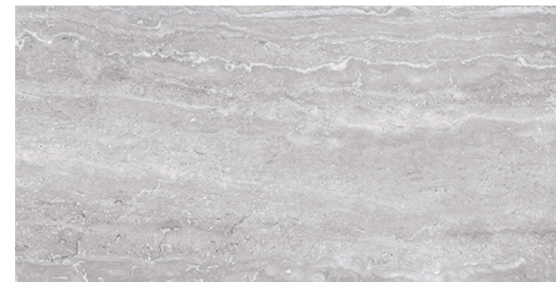
Light Gray - Calibrated 12"x24" 8.2mm Matte