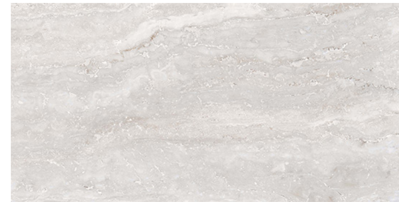
Beige - Calibrated 12"x24" 8.2mm Matte