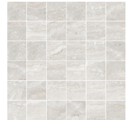
Beige 2x2 Mosaic 12"x12" 8.2mm Matte