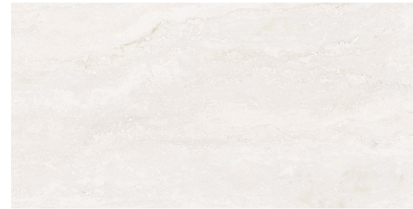
White - Calibrated 12"x24" 8.2mm Matte