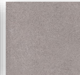
Silver Stone MS55