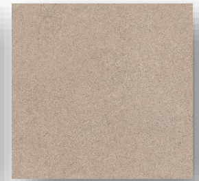
Taupe Plateau MS53