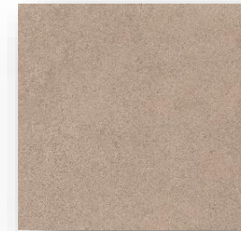
Copper Cliffs MS54