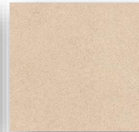
Beige Bluff MS52